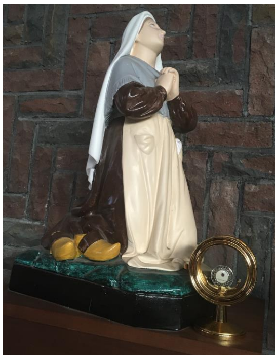
The Relic of St Bernadette at Our Lady Crowned Church

After Mass there will be Virtual Exposition of the Blessed Sacrament until 10.30am concluding with The Blessing of the Sick and Your Homes.